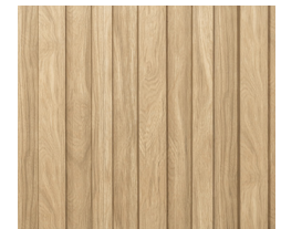
3 planks shades