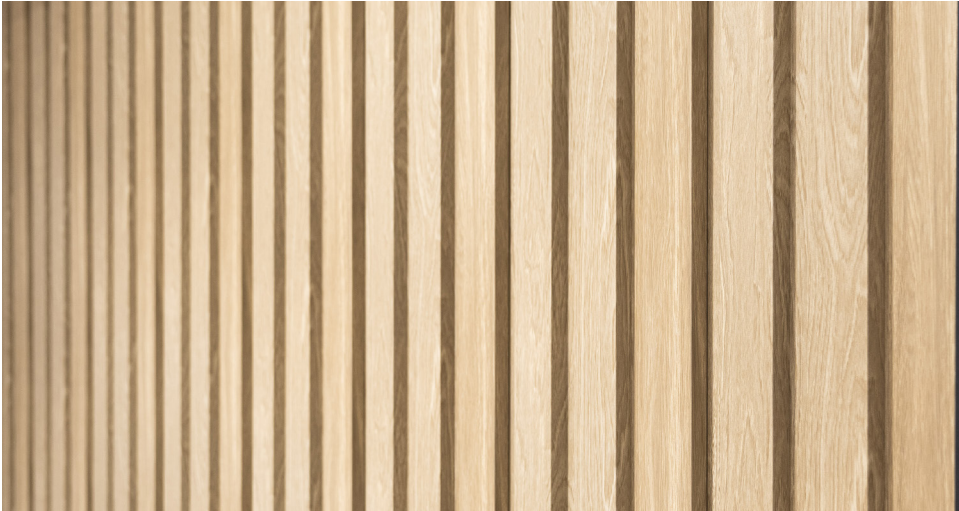
FLUTED PANEL 1.1

Prefinished Steel Wall Profile Without Visible Screws