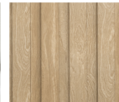
2 planks shades